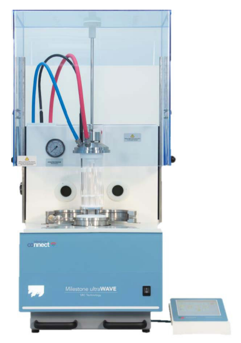
Figure 1. Milestone's ultraWAVE.