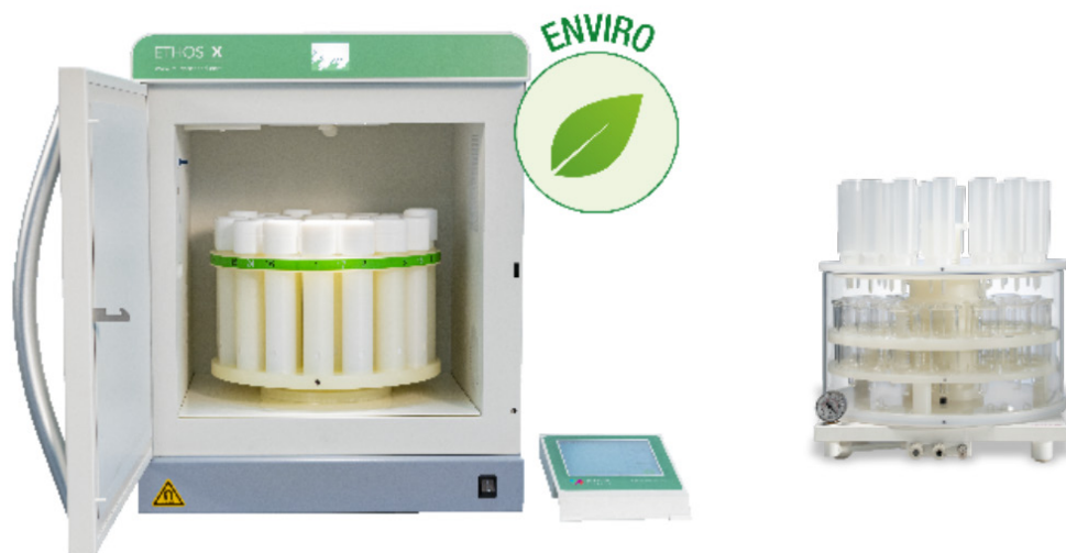
Figure 1. Milestone ETHOS X with fastex-24 eT (left) and SFS-24 filtration system (right).