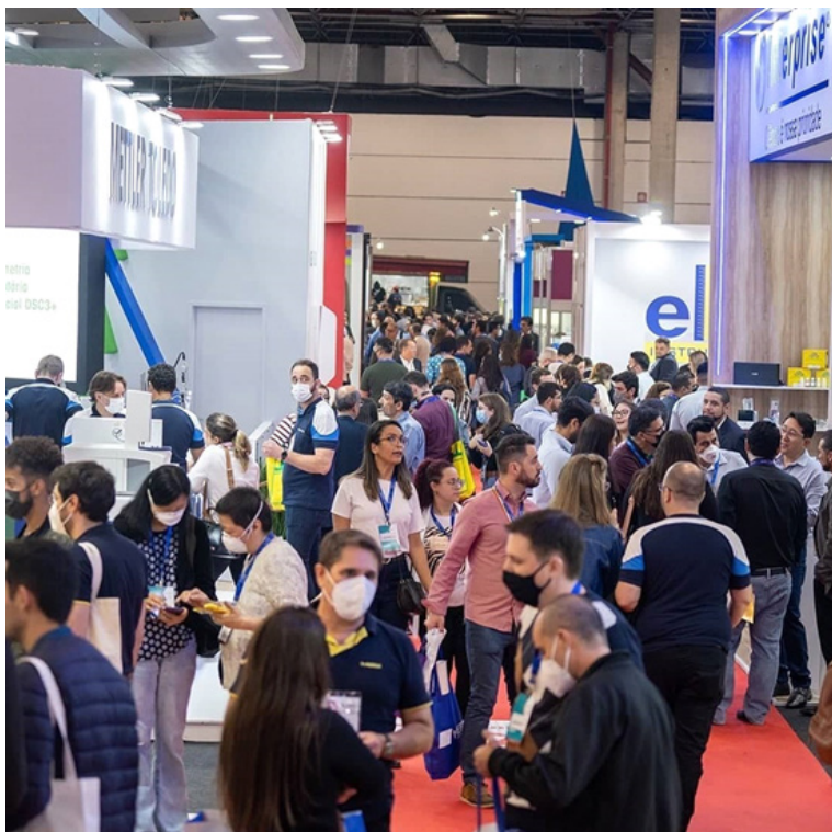
Attendees circulating in the exhibitor area.

On the first day of the event, the 16 th Analitica Latin America Expo brought together 15 exhibitors with 50 potential buyers in a reserved space favorable to the consolidation of partnerships. Over two hours, about 190 meetings were held in order to facilitate the negotiation between the two parties. The meeting moved around US$ 200,000.