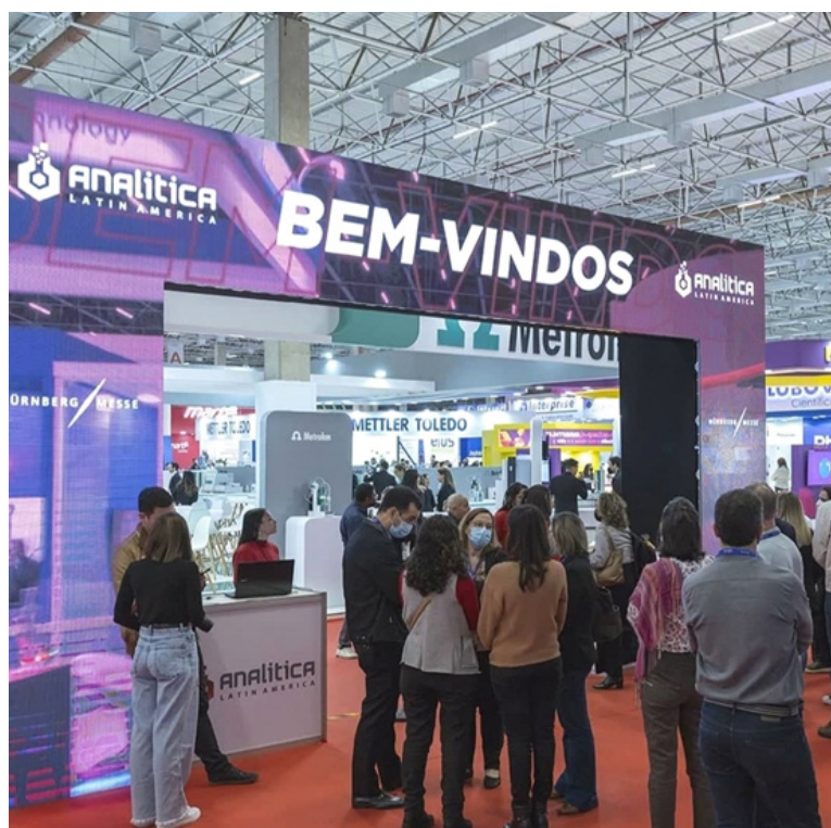
Attendees at the entrance of the Analitica Latin America Expo.

Analitica Latin America Expo is one of the main meeting points worldwide for professionals involved with Analytical Chemistry. The event brings together different market segments, such as pharmaceuticals, cosmetics, food, petrochemicals, agribusiness, and others.